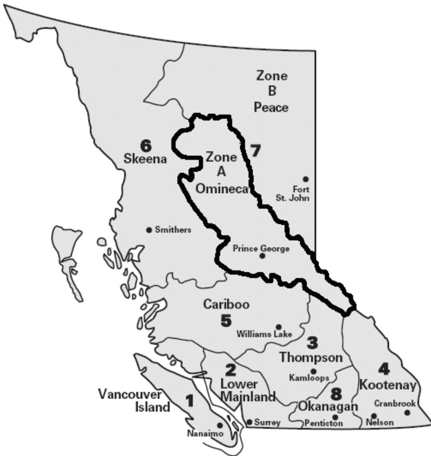
Fig. 1. The Omineca sub-region (Region 7A) of the British Columbia Ministry of Environment in central British Columbia.

( Betula papyrifera ) (Child 1992). An outbreak of mountain pine beetle ( Dendroctonus ponderosae ) has killed pine stands from the mid-1990s to the present (2009) throughout the study area and extensive salvage logging of these stands occurs (Ritchie 2008).