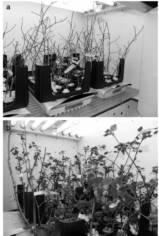
Fig. 1. Harvested stem tops of aspen ( 12 \pm 3.0 g) within an Environmental Growth Chamber at; a) initial and b) final stages of a 60-day incubation period to assess regrowth potential.

We used one-way analysis of variance for unequal sample sizes (ANOVA; Zar 1999) to compare differences between clipping treatments and controls; new growth and pre-existing stem mass, mean stem diameter normalized to set weight stem mass, and dormant and active buds normalized to set